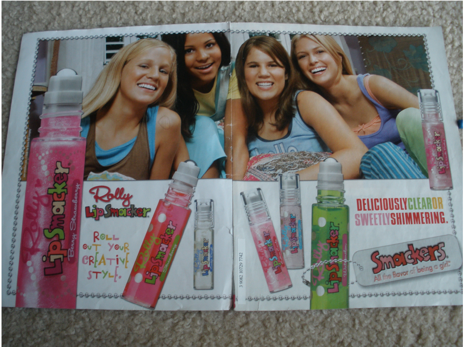
APPENDIX B: IMAGE 4